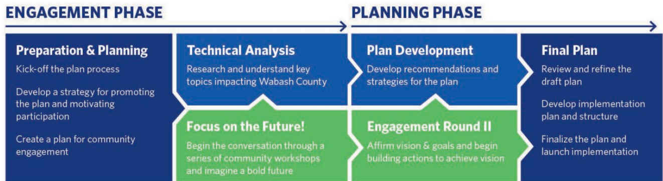
Figure 1: The Imagine One 85 Planning Process will take place over a 14-month period with multiple opportunities for the public to share and explore the plan.

Imagine One 85 is an open and inclusive process. While ultimately adopted by town councils and county government, the plan is created by the communities of Wabash County. If you care about the future of our communities, you are invited to participate.