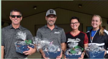
2 nd Place - Wings Etc.