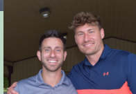
3 rd Place Wellbrooke of Wabash

The annual WACCY Golf Outing took place on June 5, 2024 where 96 golfers and 15 volunteers gathered to support local businesses, promote community engagement, and raise funds for various initiatives. Gaunt & Son Asphalt Inc. won the event along with the prestigious WACCY Championship Belt! Other various organizations and leaders assisted with the success of this sold out event.