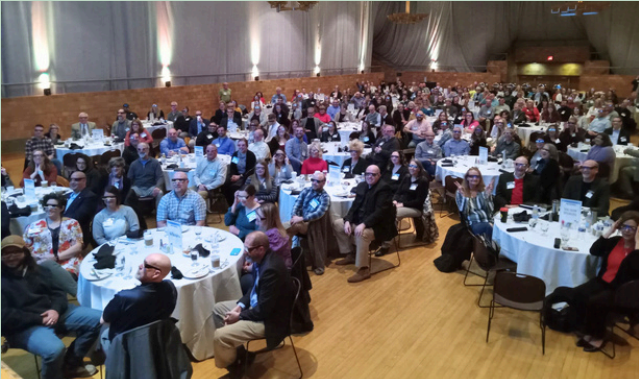
Solar Eclipse of Opportunity

The annual State of Our Communities event was held on February 12, 2024 where 250 attendees heard exciting updates from government leaders about the accomplishments of the past year and the plans for the year ahead. This event provided an opportunity to celebrate our shared success and look forward to the continued growth and development of our community, and right before the solar eclipse.