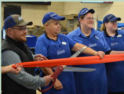
Wabash Culver's, Wabash Carnegie Public Library, & Morning Mingle