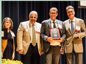
Business of the Year Kalenborn Abresist