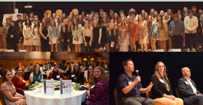
Celebrated 72 High School Seniors

The annual Honor Student Luncheon was held on April 9, 2024 where 142 attendees gathered to celebrate the top 20% of the senior class from all county high schools. This event gave the students an opportunity to see firsthand that Wabash County businesses support their future endeavors, while also highlighting the importance of community involvement and fostering a positive, supportive environment.