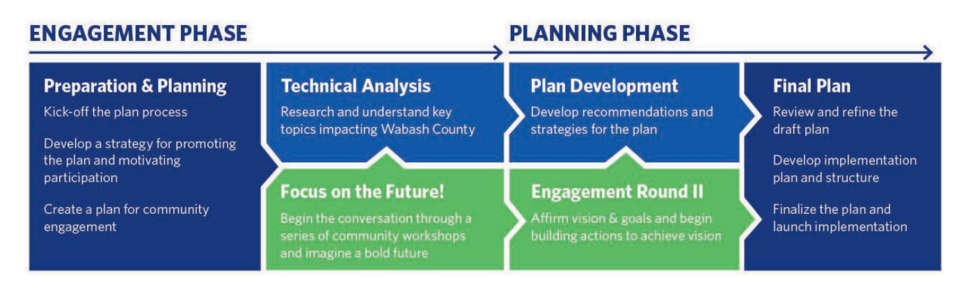
Figure 1: The Imagine One 85 Planning Process will take place over a 14-month period with multiple opportunities for the public to share and explore the plan.

Imagine One 85 is an open and inclusive process. While ultimately adopted by town councils and county government, the plan is created by the communities of Wabash County. If you care about the future of our communities, you are invited to participate.