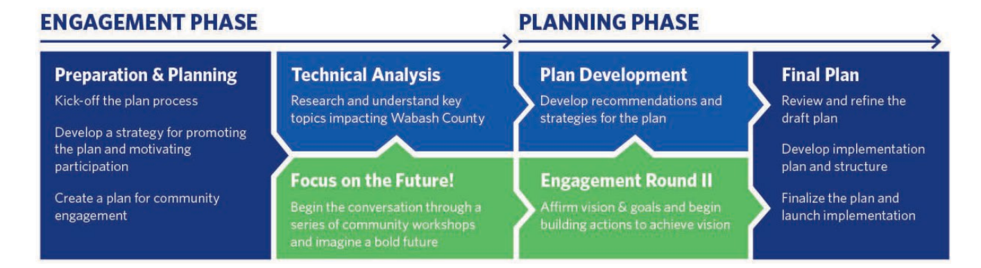
Figure 1: The Imagine One 85 Planning Process will take place over a 14-month period with the summit representing the second round of engagement.

Imagine One 85 is an open and inclusive process. While ultimately adopted by town councils and county government, the plan is created by the communities of Wabash County. For more information regarding the process, please visit <a href="https://www.imagineone85.org">www.imagineone85.org</a>.